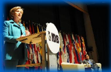
First Ministerial Meeting held at the OAS and IDB Washington, DC