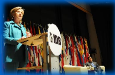
First Ministerial Meeting held at the OAD and IDB Washington, DC