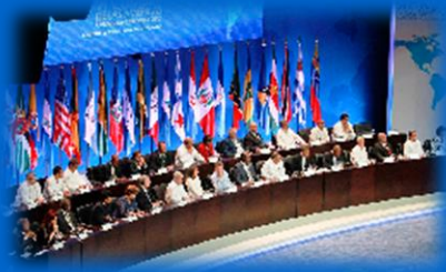
Sixth Summit of the Americas Cartagena, Colombia