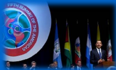
Fifth Summit of the Americas Port of Spain, Trinidad and Tobago