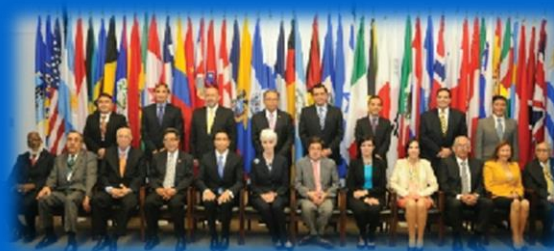
Connect 2022 Ministerial IDB Headquarters, Washington DC