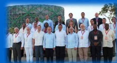
Second Ministerial Meeting Merida, Yucatan - Mexico